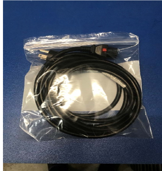
8.5 Ensure power cable is wrapped, secured in sealed bag, and placed inside unit's box