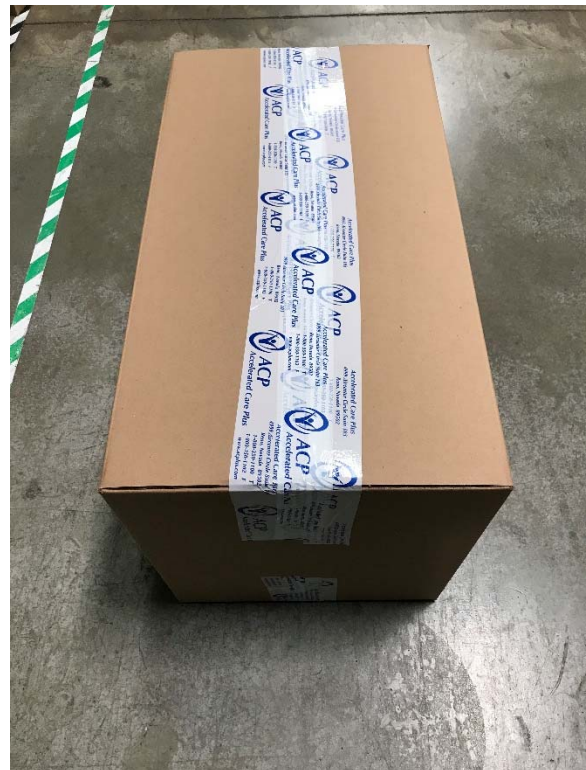
9. Tape the box closed, ensuring that the seams are secure enough to shipping.