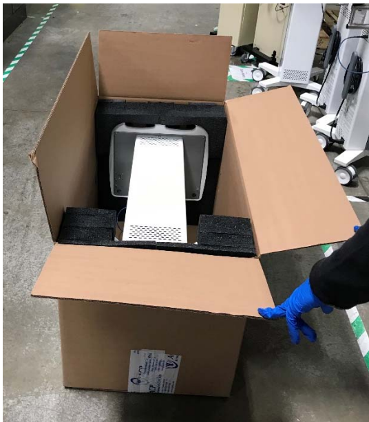
8. Carefully tip the box with SWD until it is resting on its side.