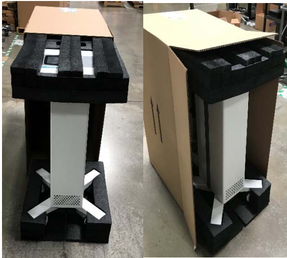
7. Slide the unit into the box. Ensure the box Arrows are pointed upward.