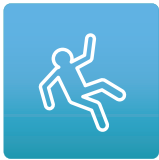
Fall Prevention & Balance

Our customizable evidence-based programs combine innovative technologies like the OmniVersa with customized clinical protocols and pathways, advanced therapist training and on-going support by ACP’s physical and occupational therapists to ensure you achieve better outcomes for your patients in the most efficient manner.