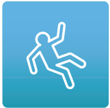
Fall Prevention & Balance

Our customizable evidence-based programs combine innovative technologies like the OmniVR with customized clinical protocols and pathways, advanced therapist training and on-going support by ACP’s physical and occupational therapists to ensure you achieve better outcomes for your patients in the most efficient manner.